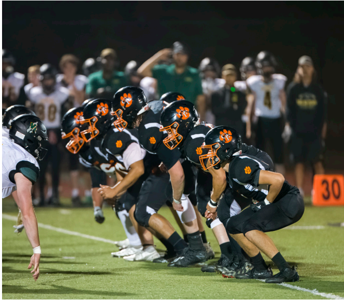
GFHS football players line up against Vashon Island on Homecoming Day.