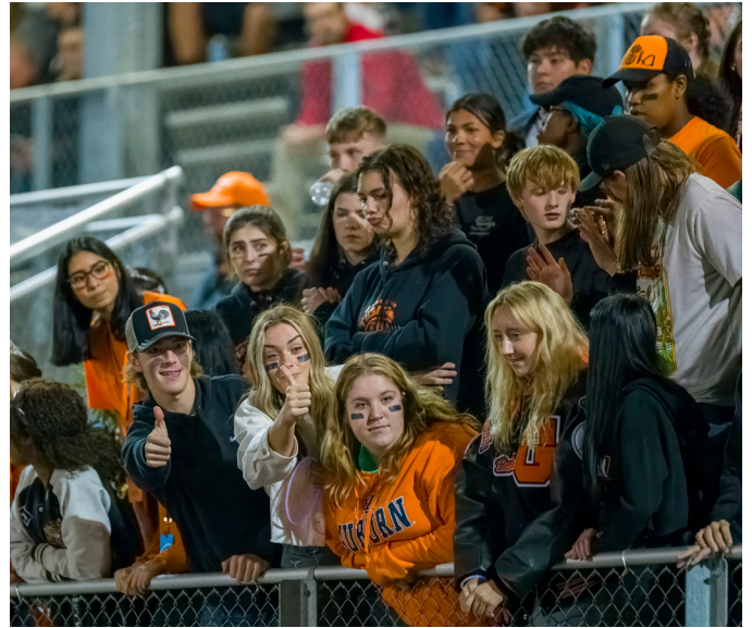
GFHS students, wearing black and orange, cheer on the home team on Homecoming Day.