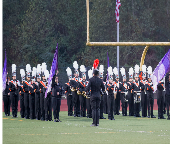
The Granite Falls High School band performs for the enthusiastic crowd at halftime.